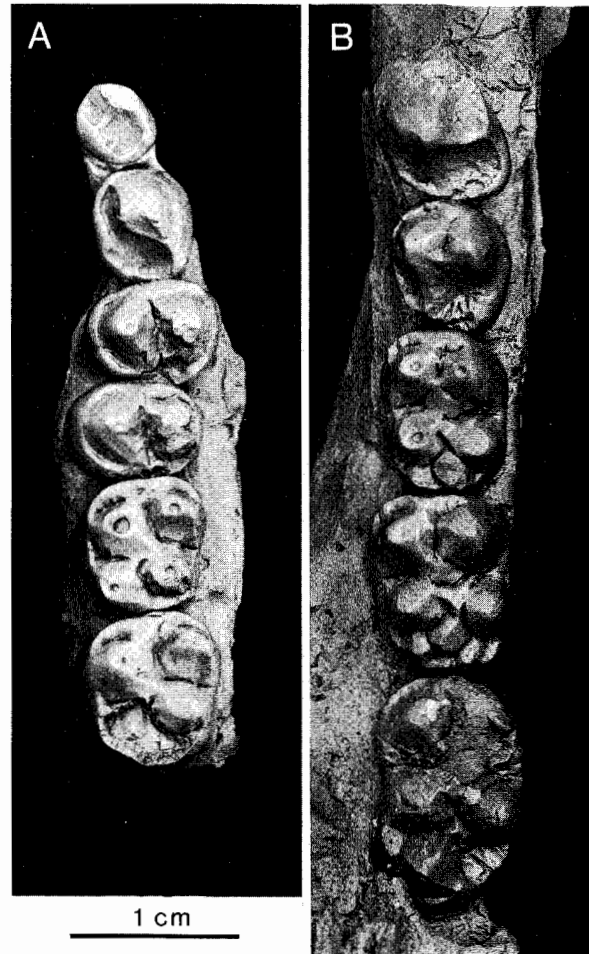
Occlusal views of Oreopithecus bambolii from Baccinello, Italy: left P_2-MP of subadult female (left), left P_3-M_3 of male individual in other figures. Photographs of casts (for clarity of detail).

A. Rosenberger and E. Delson have suggested that, in a number of dental features, Oreopithecus is intermediate in a homologous way between ancestral cercopithecids (e.g., victoriapithecines or the inferred common ancestor of all cercopithecids) and early catarrhines. For example, O. bambolii has elongate upper molars (while those of most hominoids are square or wide); reduced hypoconulids on dP_4-M_2 ; reduced cingulum on upper and lower molars, with remnants in the same places as seen (further reduced) in cercopithecids; molar cusps placed in transverse pairs (protoconid opposite metaconid, paracone opposite protocone, etc.), rather than offset as in hominoids, and with some development of transverse creasting; increased relief of molar teeth (tall cusps and deep clefts); and a partial approach to the mirror-image pattern of occluding uppers and lowers seen in Old World monkeys. It is clear that Oreopithecus is not bilophodont, as are modern cercopithecids, but neither was the earliest ancestor of monkeys. What Rosenberger and Delson were suggesting was that a common ancestor of cercopithecids and oreopithecids had already experienced selection for a number of shared trends before the two groups diverged in different directions.